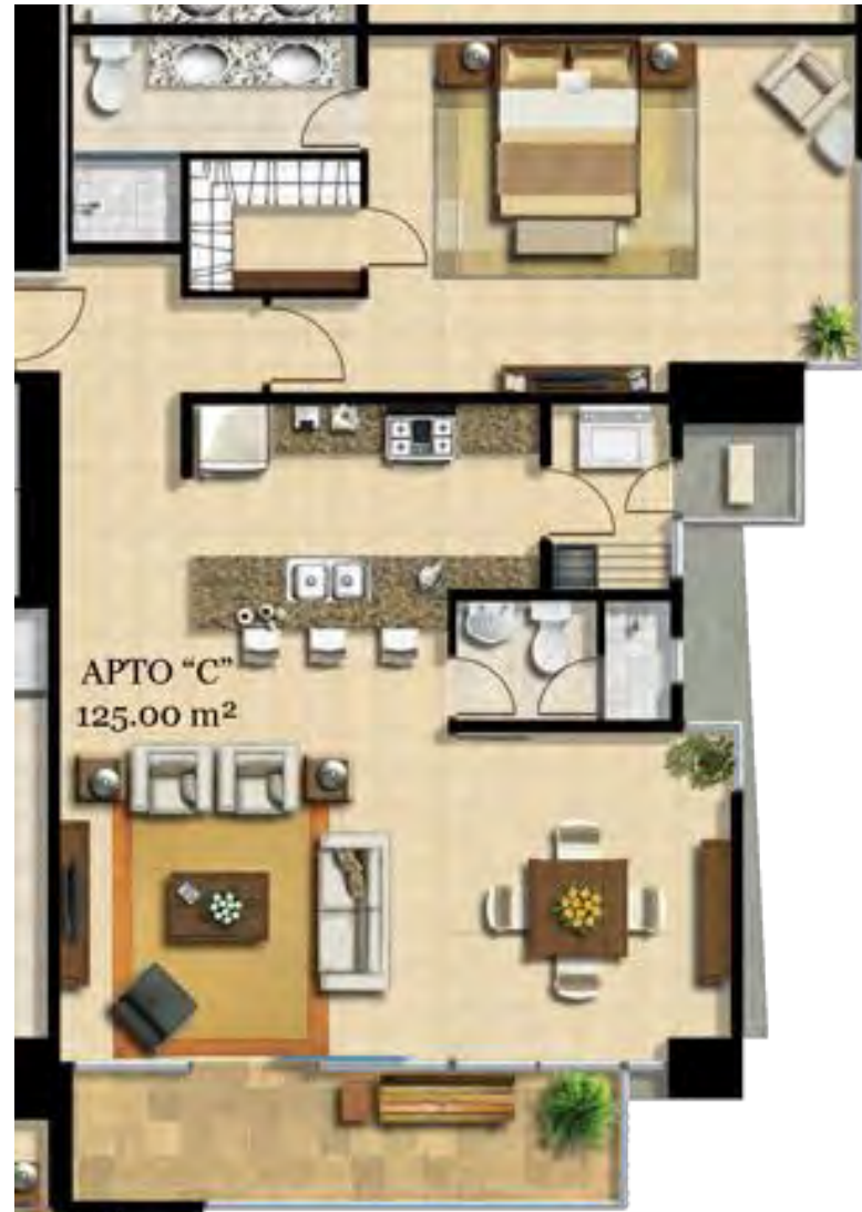
Vista al Boulevard

LEVELS 600, 700, 900 – 1300, 1500- 1900, 2100-2500, 2700, 2800, 2900, 3600, 4400