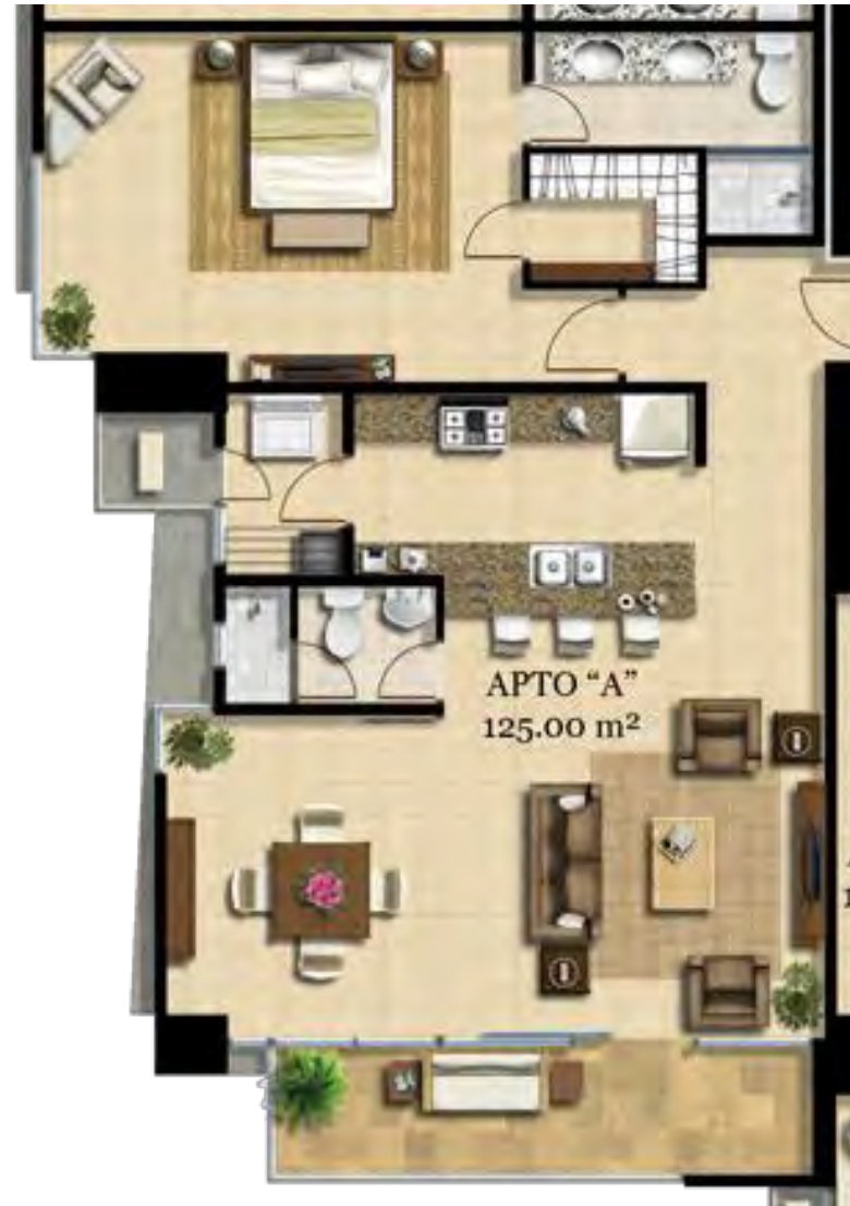
Vista al Boulevard

LEVELS 600, 700, 900 – 1300, 1500- 1900, 2100-2500, 2700, 2800, 2900, 3600, 4400