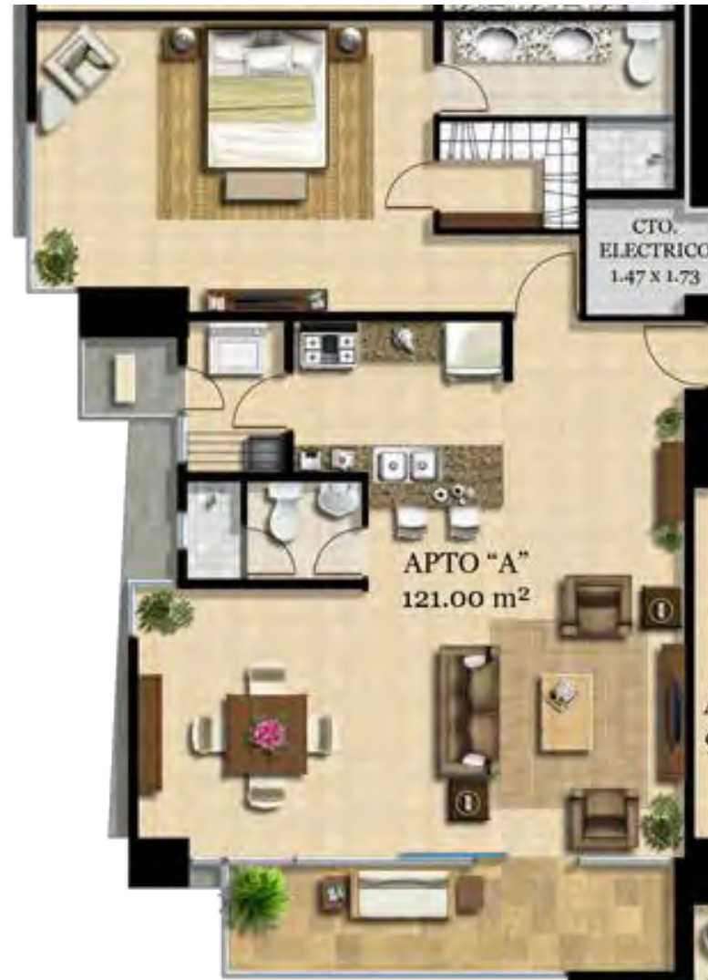
View to the Boulevard