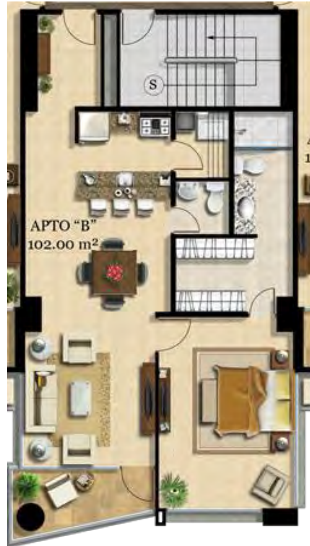
Vista al Boulevard

LEVELS 600, 700, 900 – 1300, 1500- 1900, 2100-2500, 2700, 2800, 2900, 3600, 4400