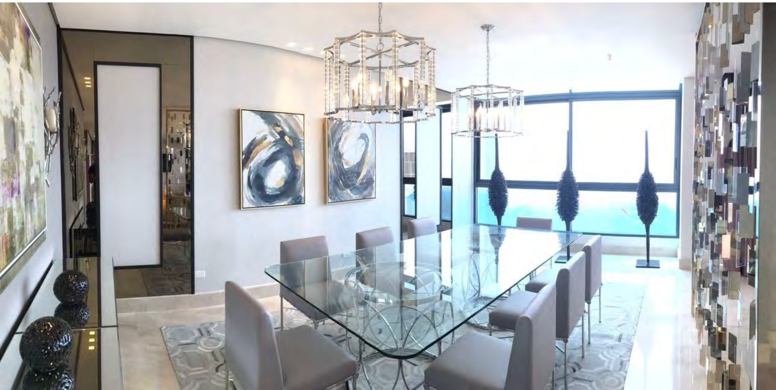
Model Apartment on Site