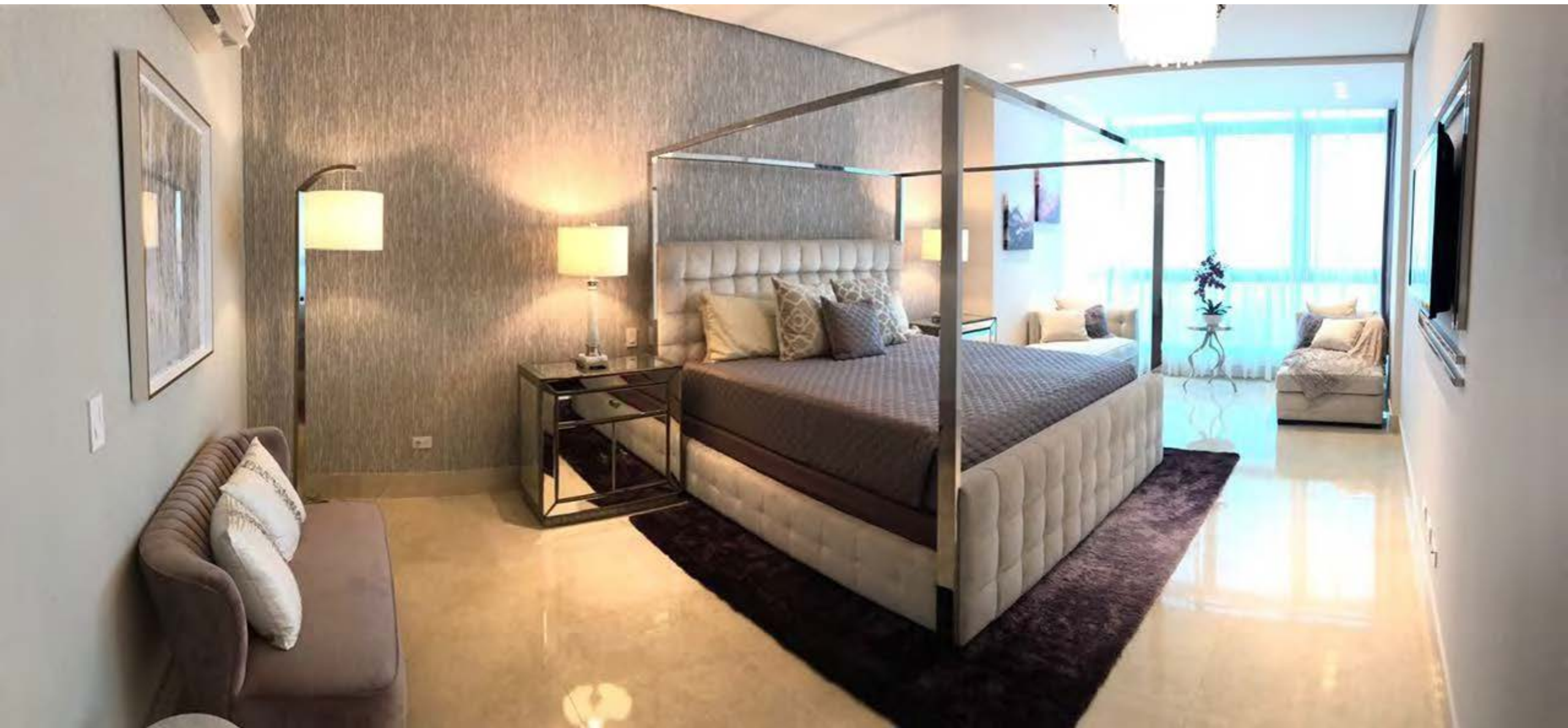
Model Apartment on Site