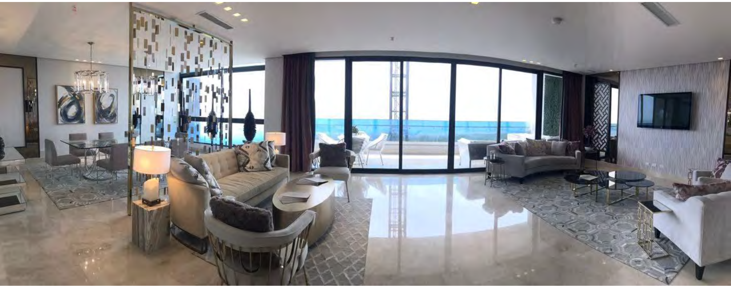
Model Apartment on Site